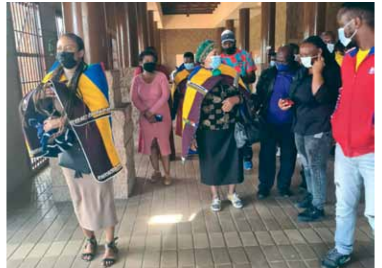
Community members from Siyabuswa and surrounding places came in numbers to the Mdtjane Magistrate's Court to oppose bail of the suspects who robbed Dr Esther Mahlangu.