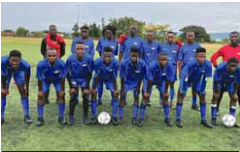
Dennilton United FC have completed their matches and are the winners of the SAFA Sekhukhune Regional SAB Football League D1 Stream.