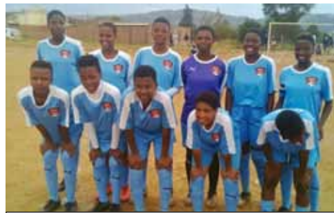
Milan Ladies from Glen Cowie Village will be among women football teams to participate in the SAFA Sekhukhune Womens Football League to commence on 24 April.