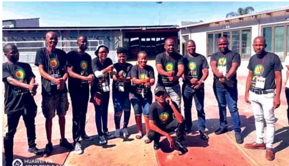
The ANCYL in Sekhukhune Region has during its first meeting committed to fight unemployment among young people.