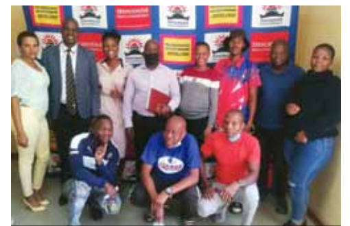
The newly elected Elias Motsoaledi Local Municipality Sports Confederation promises to take sports to the new heights in the local municipality villages.